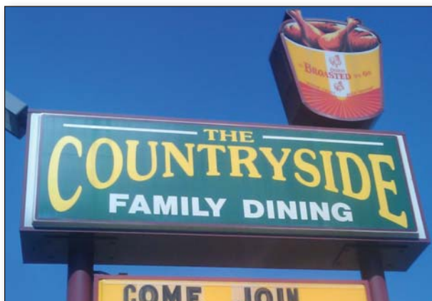
Even Jim’s sign has the “old school” take-out bucket prominently displayed.

Broaster has been the staple of Countryside for a long time. Today, their Broaster program accounts for 80% of their total business.