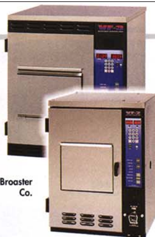
The Broaster Co.

Scotsman Ice Systems, An Enodis Co. The Prodigy™ ice machine qualifies for the EnerLogic™ seal for energy efficiency and comes equipped with a self-monitoring system that provides reports on both unit performance and maintenance needs. The cuber features WaterSense™ purge control that automatically adjusts the purge water amount to minimize scale buildup. www.scotsman-ice.com