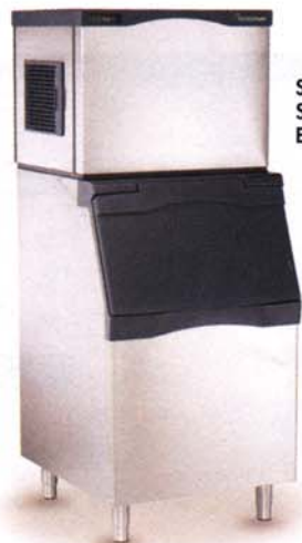
Scotsman Ice Systems, An Enodis Co.