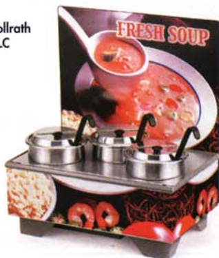
The Vollrath Co., LLC