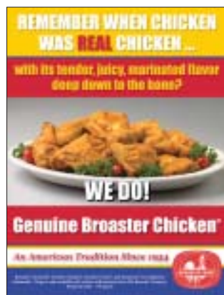
PN 92476 Real Chicken Poster