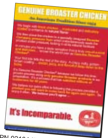
PN 92164 It's Incomparable Poster