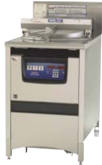
See the brand new 2400 Electric pressure fryer!

Plus, A Wide Range of High-Quality Foodservice Equipment: Deli cases, metal modules, rotisserie and convection ovens, holding cabinets, utility tables, automatic breaders and marinators, soup warmers, cold top refrigerators, undercounter freezers, landing and dump tables, and more!