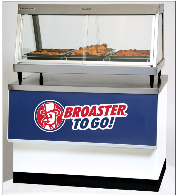
GRHD-3P with stainless steel finish (shown with optional pass-through doors and 4' metal module base cabinet).

* optional designer colors are not retrofittable