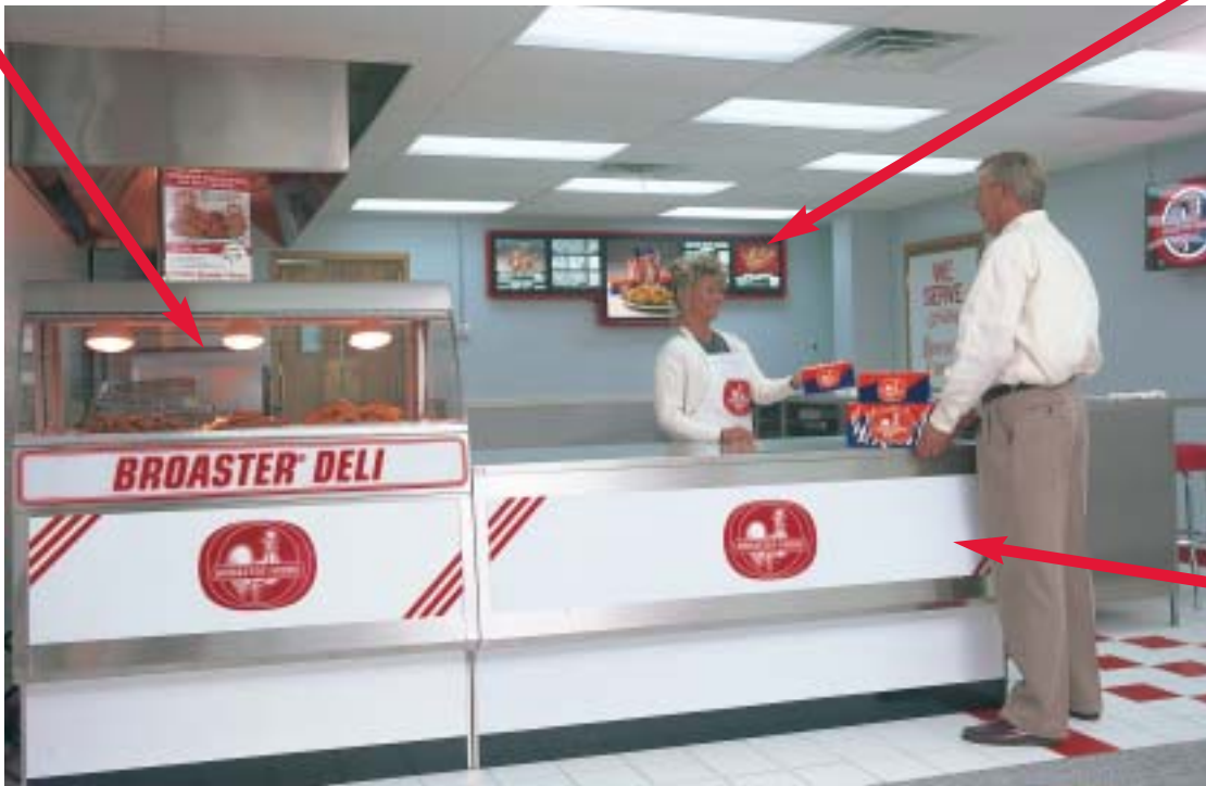
Broaster Metal Module