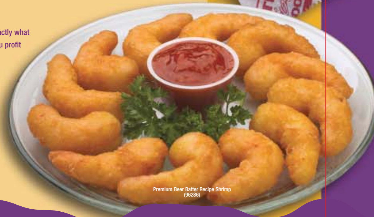
Premium Beer Batter Recipe Shrimp (96236)

Because it comes ready-to-cook, portion size and weight are always consistent, helping you control your costs.