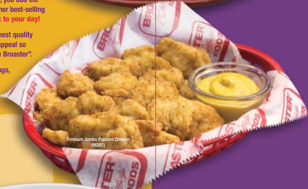
Premium Jumbo Popcorn Chicken (96262)