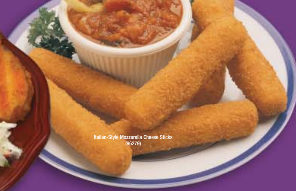
Italian-Style Mozzarella Cheese Sticks (96279)