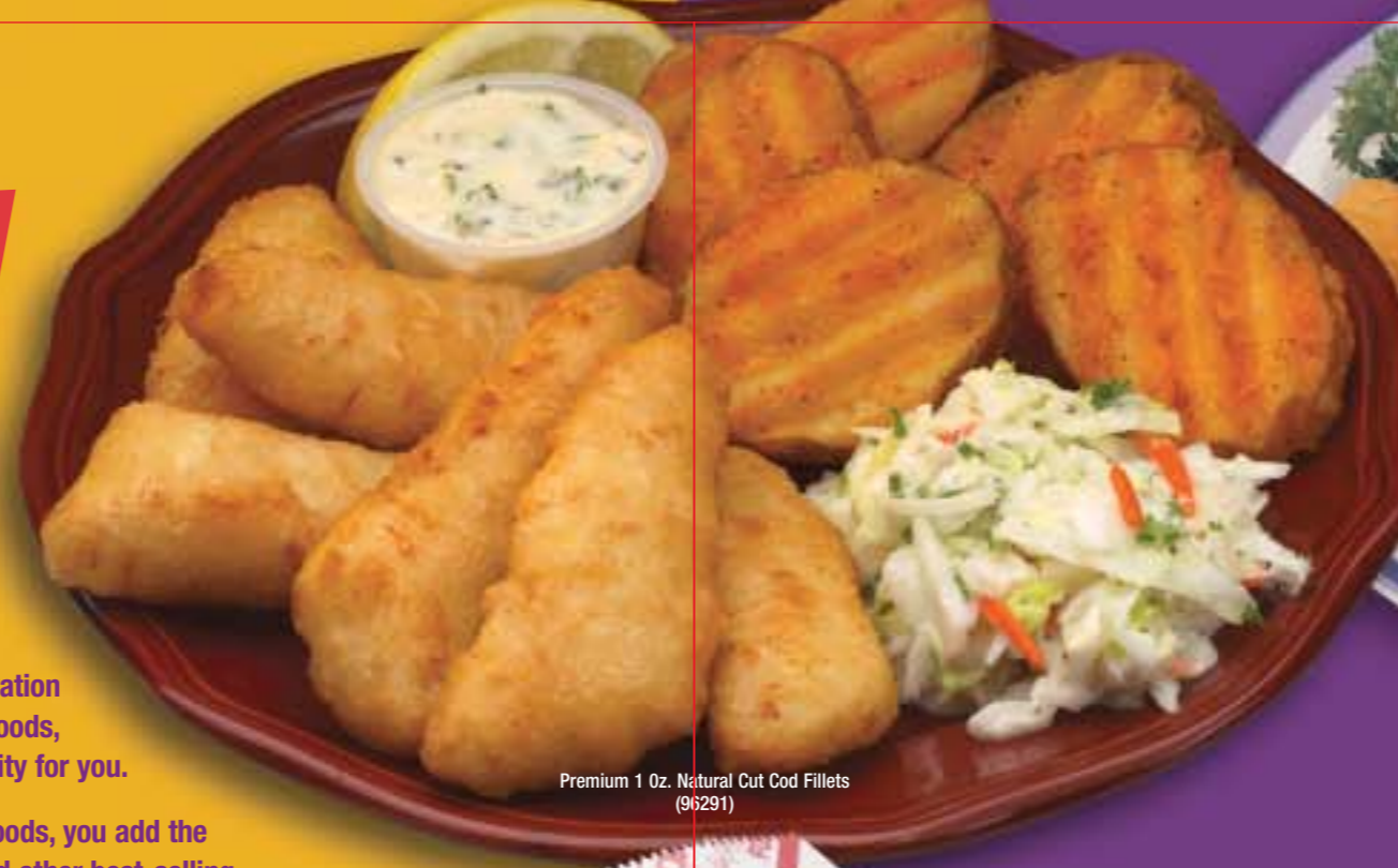
Premium 1 Oz. Natural Cut Cod Fillets (96291)

With Broaster® Recipe Foods you get all our popular seasonings, coatings and flavorful marinades in a full-line of popular foods: chicken, catfish, meats, potatoes and more! So the quality, taste and texture is what you've come to expect from Broaster.